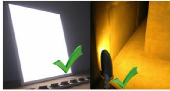
2. Sample test before production