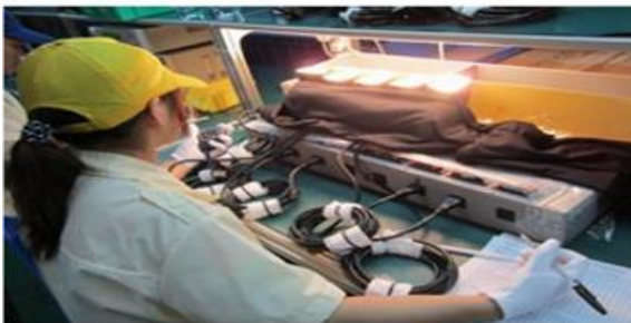
7. QC Inspection