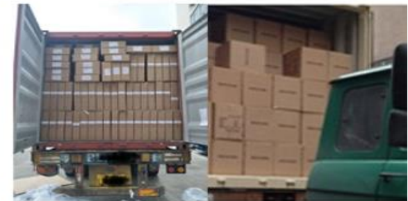
9. Load and Shipping