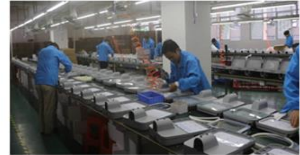
3. Assemble and production