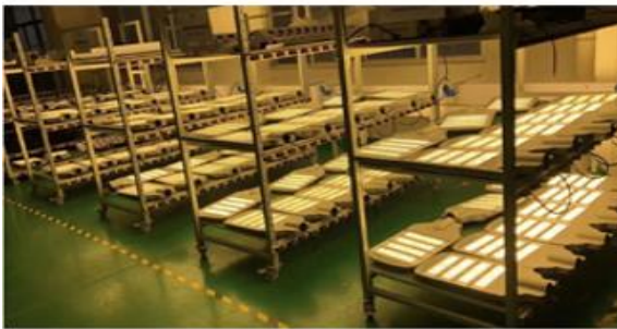
4. Age testing