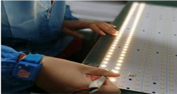
1. Inspection for raw materials