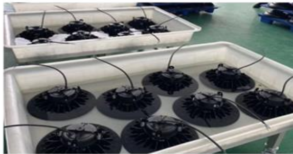
5. Waterproof test(if needed)